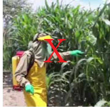
Kasooli tomufuuyira ddagala limukazza ng'oluubirira akale mangu