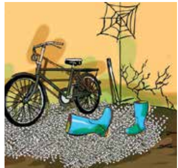
Kasooli tomutereka mu bifo bijama