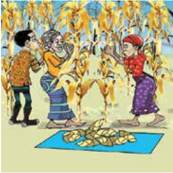
Kungula kasooli ng'akaze bulungi.