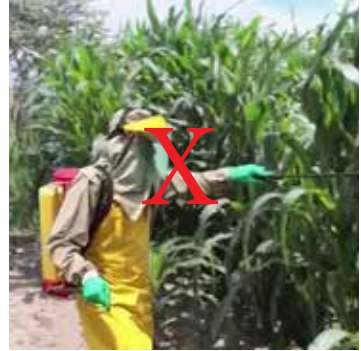
Kasooli tomufuuyira ddagala limukazza ng'oluubirira akale mangu