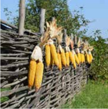
Kasooli mukalize kubikingoliro