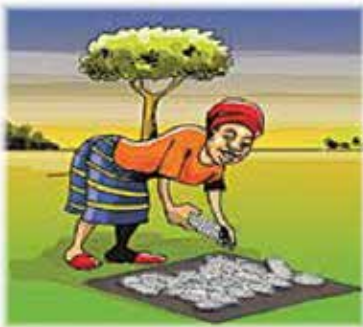
Kasooli mukalize kutundubaali, emikeeka oba ebiwempe