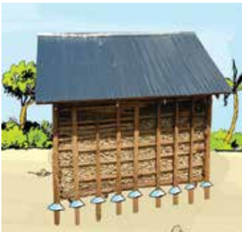
Kasooli mutereke mu kyagi oba mu kuttiya