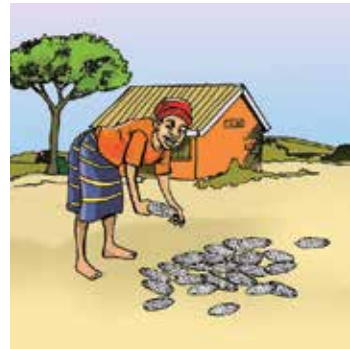
Kasooli tomukaliza butereevu kuttaka