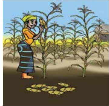
Tokungula kasooli okutuusa ng'akaze bulungi